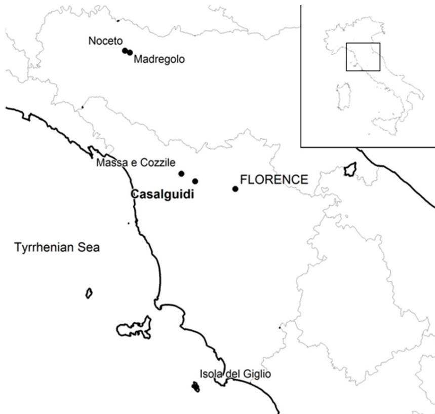
Figure 1 Geographical location of Casalguidi and the other parishes mentioned in the text

The parish registers of baptism, marriage, and burial show continuity over time between 1819 and 1859. The information contained in such registers are typical of Catholic records: the date of the event, name and surname of the recorded person(s), and father's and mother's names. Occupation and age were infrequently recorded, although the latter was often annotated for individuals who died at very young ages (see Table 1 for a complete overview).